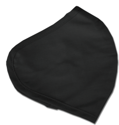
4-Ply Cotton Mask