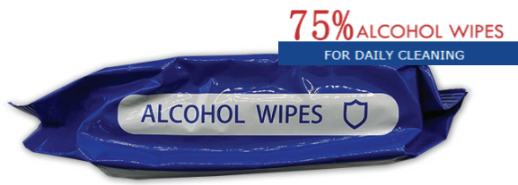
Anti-Microbial Alcohol Wipes (50 Pack)