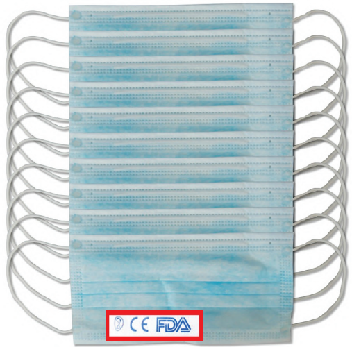
3-Ply Ear-loop Masks