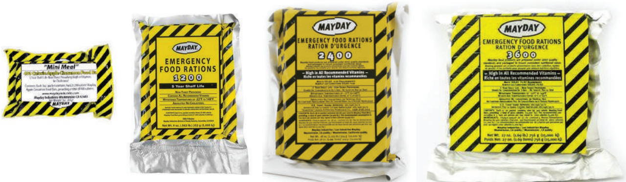
400 Calorie (#73450)