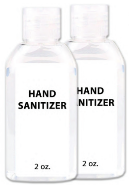
Hand Sanitizer, 2 oz.